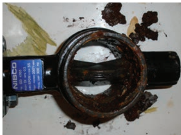
11 weeks after Aqua-Rex was installed