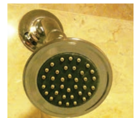
Mar 29 th 2011