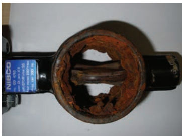
badly scaled valve Feb, 2009