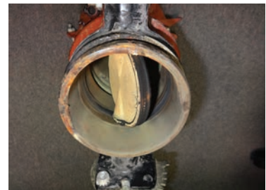
completely scale free valve Dec 2014

A typical butterfly valve from a luxury hotel hot water supply which was so badly scaled it couldn't be operated. For a trial evaluation it was re-installed on a cold water line fitted with Aqua-Rex. After eleven weeks the scale had broken away from inside the valve and fallen out. The scale broke down into fine particles and was carried away in the flow without causing any downstream damage. This 2,500 room hotel tower was fitted with Aqua-Rex in 2011. In December 2014 a similar valve from the hot water supply system was removed and found to be completely scale free.