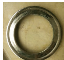
Jan 26 th 2011